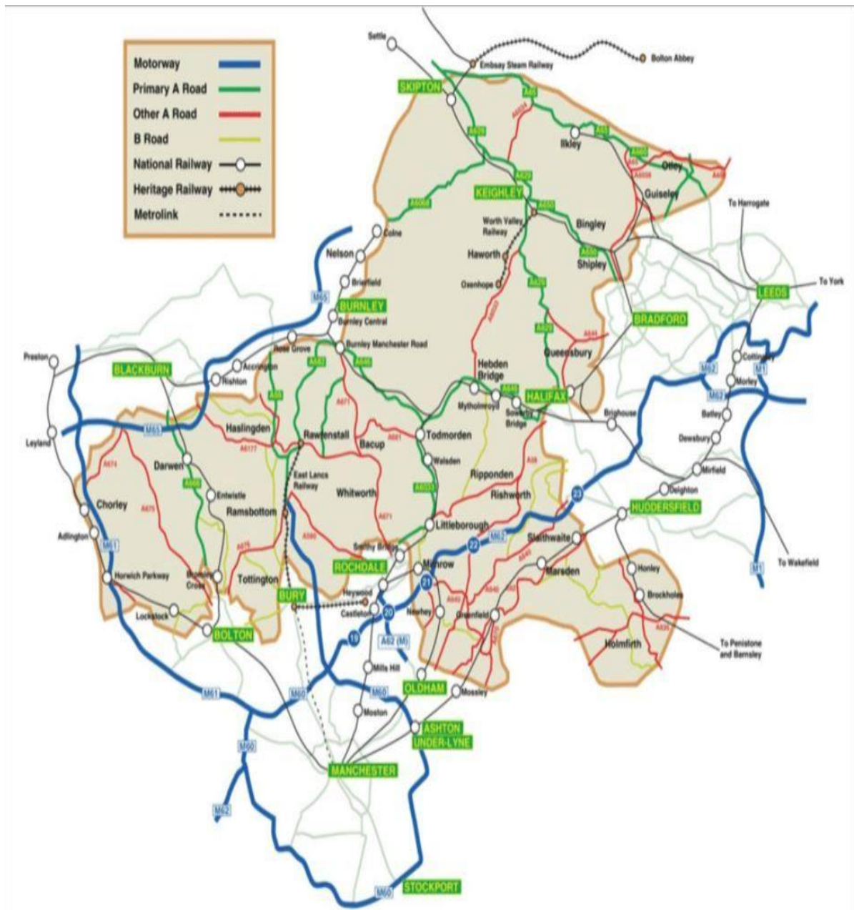
Map of South Yorkshire Park

She said that this will unlock the resources needed to ensure residents and visitors enjoy the positive benefits of being closer to nature.